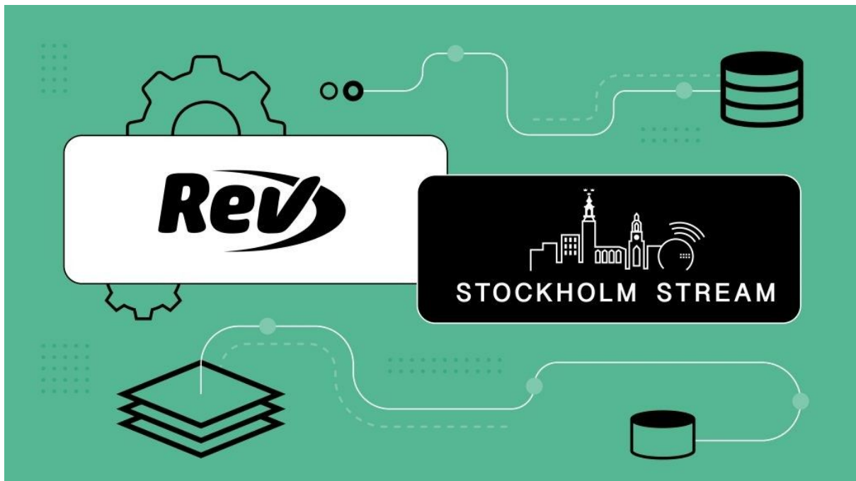
Rev Announces Partnership with Stockholm Stream

Rev is excited to announce our partnership with Stockholm Stream ; a fully self-serve content management system that uses their native SaaS platform, Delta , to simplify the delivery of video-on-demand assets en masse to any global VOD platform. With this partnership, Delta now provides Rev's speech-to-text services within its platform.